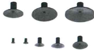
Selection of different sizes of vacuum cups.