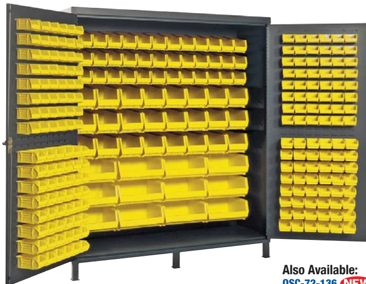
QSC-72 72"W x 24"D x 84"H. Flush Door model. Ship wt. 1,002 lbs. Total of 264 bins. 96 QUS210, 96 QUS220, 36 QUS230, 24 QUS240 and 12 QUS250.

72" CABINETS NOW AVAILABLE WITH 2 BIN COMBINATIONS TO CHOOSE FROM (New wider bins on doors NOW AVAILABLE)