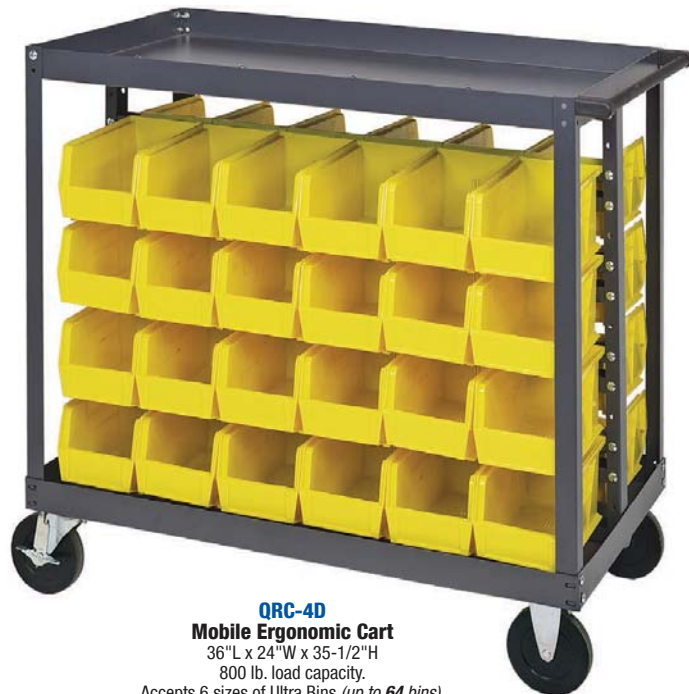
QRC-4D Mobile Ergonomic Cart

36"L x 24"W x 35-1/2"H 800 lb. load capacity. Accepts 6 sizes of Ultra Bins (up to 64 bins). Includes 2 rigid and 2 swivel, with brake, hard rubber casters. (Bins sold separately)