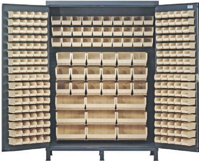
QSC-60 60"W x 24"D x 84"H. Flush Door model. Ship wt. 860 lbs. Total of 227 bins. 80 QUS210, 90 QUS220, 30 QUS230, 18 QUS240 and 9 QUS250.

Super-Wide Colossal Cabinets offer 60" or 72" widths and 84" heights allowing for maximum and efficient storage while providing superior strength and security. Standard performance features: ships completely assembled, ready to use, 14 gauge all-welded construction, gray or beige powder-coated finish which ensures years of heavy-duty service, 3 point locking handle with provision for a padlock (not included) and 6" high legs make cabinets fork truck liftable. To order a Beige cabinet, add BG right after cabinet prefix (i.e. QSC-BG-60 or MESH-BG-240 or QPR-BG-101 ). See pg. 5 for bin dimensions.