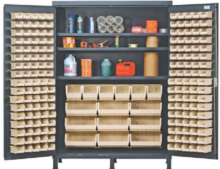
QSC-60S 60"W x 24"D x 84"H. Flush Door model. Ship wt. 878 lbs. Total of 185 bins. 80 QUS210, 90 QUS220, 6 QUS240, 9 QUS250 and 3 adjustable shelves. 500 lb. capacity per interior shelf.

CABINETS AVAILABLE IN GRAY OR BEIGE COLOR