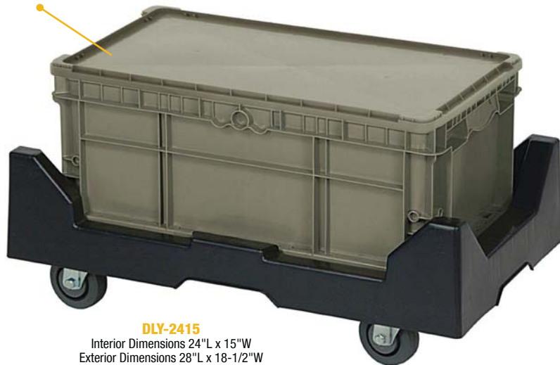
DLY-2415 Interior Dimensions 24"L x 15"W Exterior Dimensions 28"L x 18-1/2"W