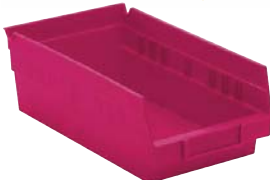
Pink color in select sizes

LOW COST, LONG LASTING, UNBREAKABLE, REUSABLE 4" HIGH BINS