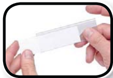
LTR-0813 Clear Label Holder and Insert Clear label holders and laser label inserts. Package of 25. Label holders fit all bins (except QSB100).