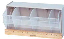
QTB410 QTB410 is a one bin design, 12" wide Each QTB410 comes with 3 DIV400 clear dividers*