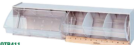
QTB411 QTB411 is a two bin design, each bin 12" wide Each QTB411 comes with 6 DIV400 clear dividers*