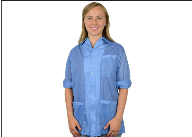
Figure 1. Desco Statshield® Smocks with Convertible Sleeves and Snaps Cuffs.