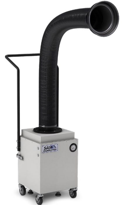
Model 300 Floor Sentry