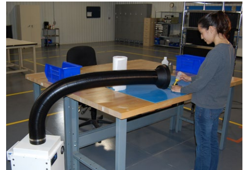
Model 300 Floor Sentry can be used to extract fumes from a wide variety of applications.