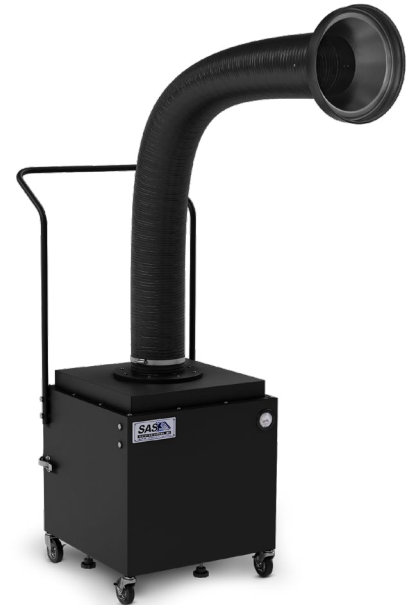
Model 400/450 Portable Floor Sentry

A smaller model [SS-300-PFS] and a larger model [SS-500-WFE-MP1] are also available.