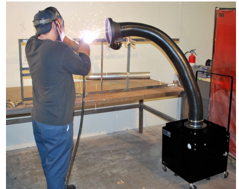
The Model 400/450 Portable Floor Sentry helps protect the operator from fumes by extracting at the source.