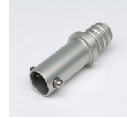
TX10217 TexConnect™ Adapter For use with TX7183 to attach screw-based mop heads.