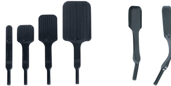
A selection of molded PEEK wafer tips for handling various sizes of wafers or substrates. The tips are available straight or with various bend angles for ergonomic ease of use. Temperatures of up to 100 C.

Check our website at http://www.sipel.ch