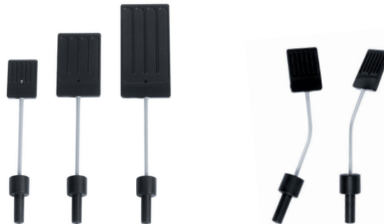
A selection of hard coated aluminum wafer tips for handling various sizes of wafers or substrates. The tips are available straight or with various bend angles for ergonomic ease of use. Temperatures of up to 250 C.

Check our website at http://www.sipel.ch