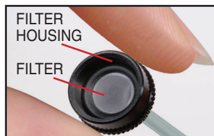
FILTER HOUSING FILTER