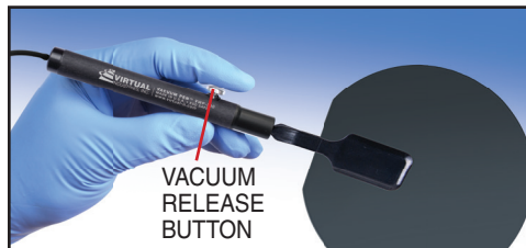
VACUUM RELEASE BUTTON