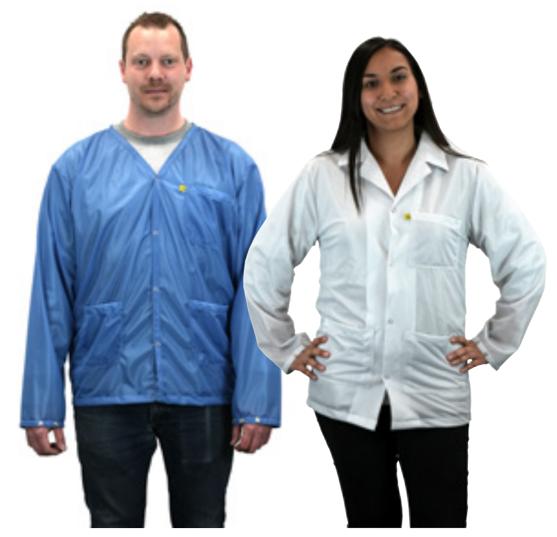
Royal Blue with V-Neck

Launder garment in cool or warm water using a neutral liquid detergent. Detergent must be surfactant, bleach and softener free. Tumble dry low heat or hang to dry. Garment will dry rapidly. Do not iron.