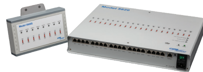
Model 5820 Ionizer Monitoring System