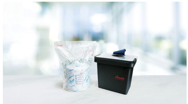
SafePlus™ Maxi + SafePlus™ Maxi Dispenser