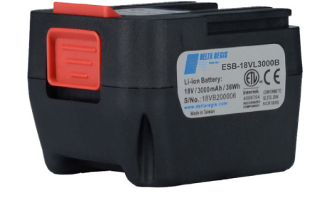
Approximate Battery Charge Times