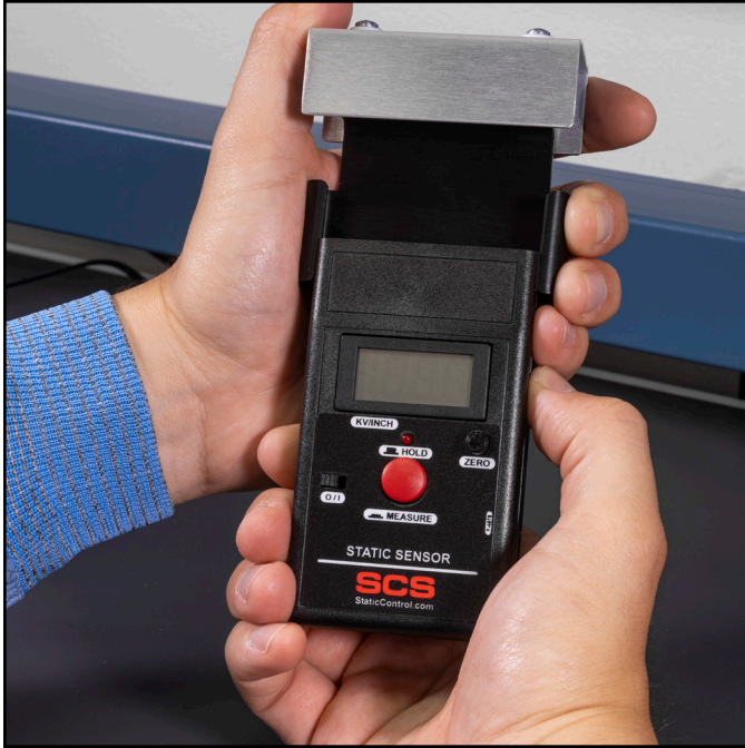
Figure 8. Sliding the Conductive Plate onto the Static Sensor