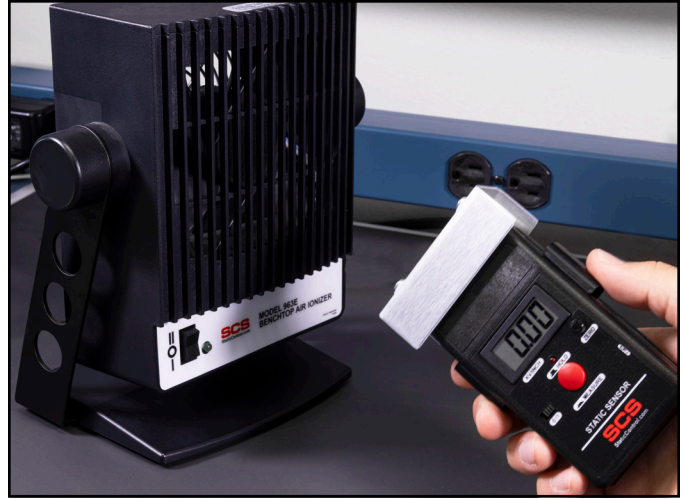
Figure 9. Using the Static Sensor with Conductive Plate to measure the offset voltage of a benchtop ionizer

NOTE: When testing pulsed ionizer systems, the voltage displayed is constantly changing. This pulse rate may be faster than the display update rate of the Static Sensor, therefore the displayed voltage is an average of the actual voltage. The output of the Static Sensor is useful in this situation for more accurate measurements.