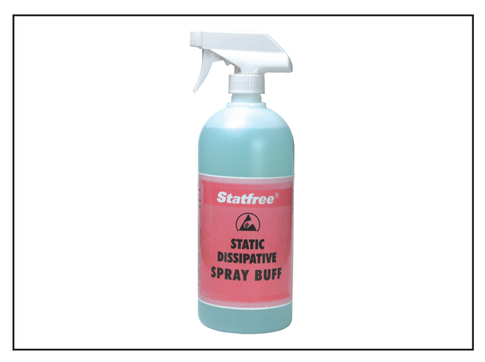
Figure 1. Statfree® Dissipative Spray Buff, ready-to-use quart spray bottle