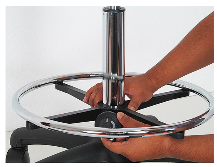
2. After inserting the gas cylinder into the base, slide the footring up the gas cylinder and secure the footring.