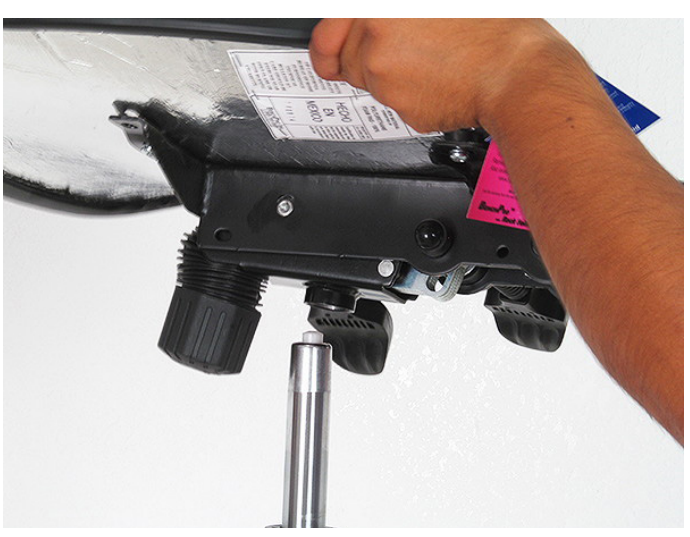
3. Place the cushion and steel plate over the top of the gas cylinder.