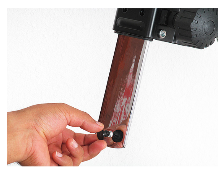
6. Insert the plastic pin onto the back bar.