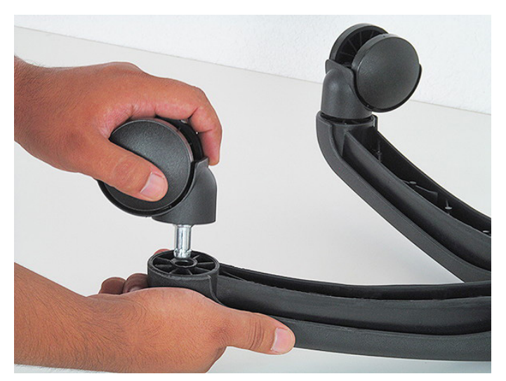
1. No tools required. Unpack the box. Insert the casters into the base. Turn the base over.