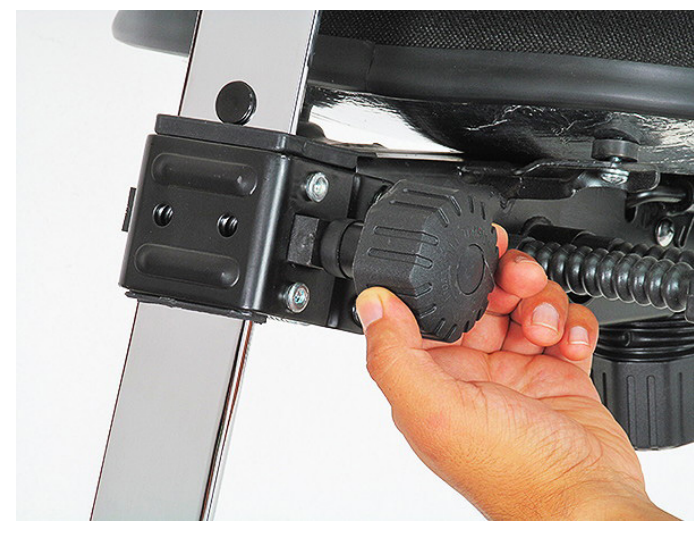
5. Adjust the back bar at desired height. Tighten.