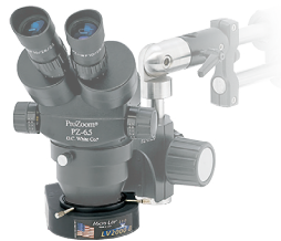
Fits Most Popular Microscopes on the Market Today!