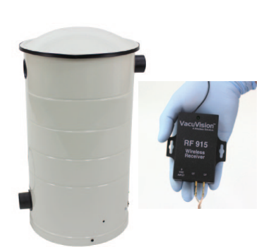
Power unit (smaller canister) with HEPA filtration bag and signal receiver