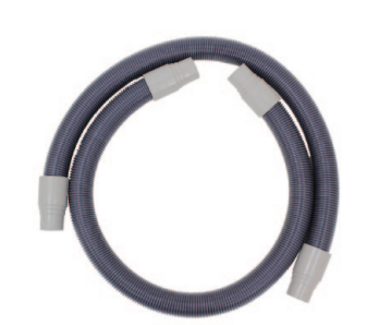
2 Hoses with connector cuffs and hose clamps (inside large canister)