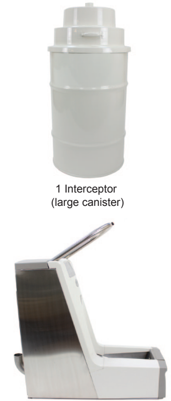
1 Shoe cover remover with installed transmitter

Before you get started taking shoe covers off faster, easier, safer, and cleaner, please refer to the inventory list and photos below to verify all the necessary parts have arrived with your shipment.