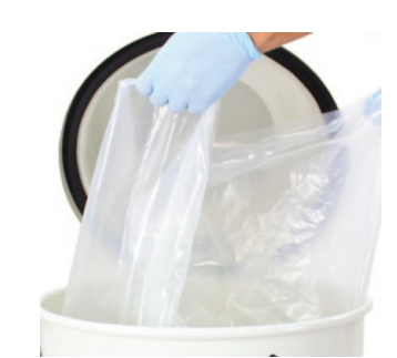
1 Package of ten (10) 3-mil plastic bags (inside large canister)

Please note: Inventory of all the parts is checked prior to shipping. In the unlikely event a part is missing, please call CleanPro at (888) 903-0333 for prompt replacement.