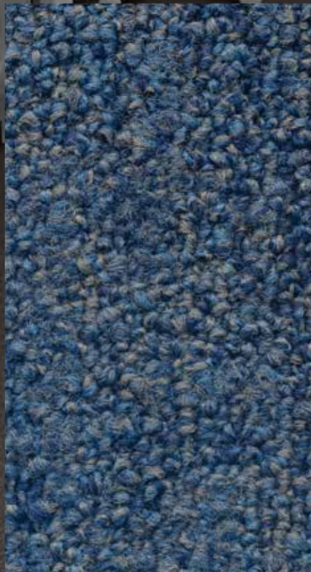
4113 Thunder Bay 24"

SHADOWFX SDC — CONSTRUCTED OF PREMIUM BRANDED YARN FOR DEMANDING ESD APPLICATIONS AND 24/7 ENVIRONMENTS.