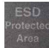
ESD Messaging Tiles Available