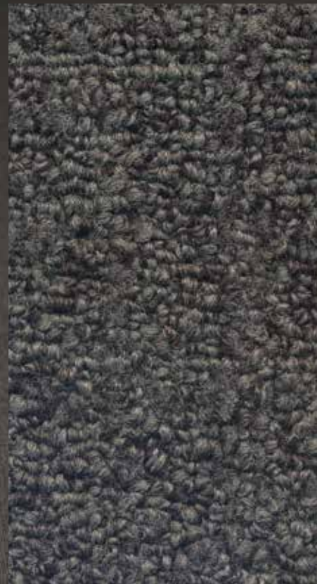
4115 Huntington Ravine 24"

*Non-stock colors available. Visit Staticworx.com to view all 18 available color options.