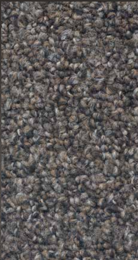
4114 Chesapeake Sandbar 24"