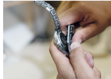
Cleaning in watch manufacture (e.g. bottom cases, watch straps, etc.)