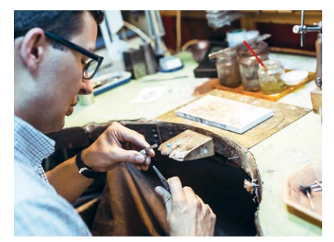
Cleaning in the jewellery industry (e.g. necklaces, earrings, bracelets, rings, etc.)

Elmasonic xtra ST devices are rated for continuous operation under the highest operational demands. The tanks are made of special stainless steel, which makes them robust with a long service life. In single-shift operation, they are guaranteed a warranty period of three years.