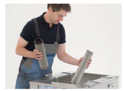
Industrial parts cleaning in workshops, production and servicing as well as for overhaul cleaning